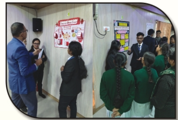
MLT And IQAC Host One-day Poster Competition: Biovision Page-3