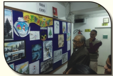
Wall Magazine at DAITM Page-4