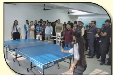
DAITM Annual Sports Meet 2026 Page-6