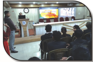
Edwise Seminar Page-2