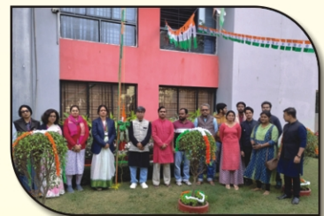
Republic Day at DAITM Page-4